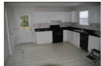
The new kitchen, complete with appliances, flooring, cabinets and dishes. Home cooking southern style was on the menu.