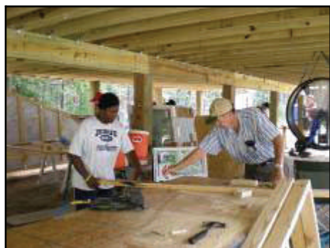
Teamwork on a roof dormer