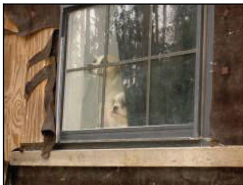
Are we getting a new home too?