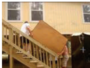
A dresser goes up the stairs of the new house into a bedroom.