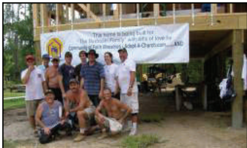
Volunteers From Week One