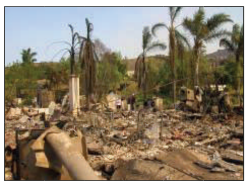
Devastation in San Diego