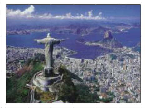
Who we work for