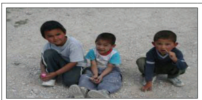
Children in Galeana, MX