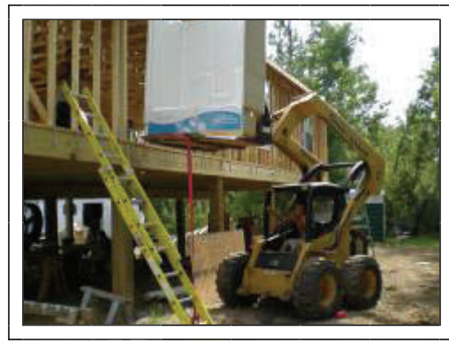
Good job CJ—just don't drop it!